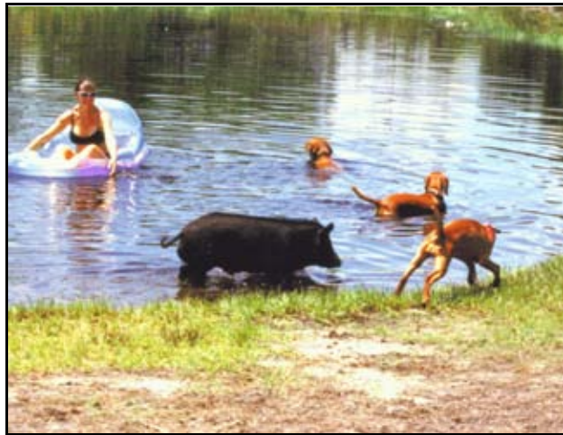
Shorty, the pig, meets the Vizslas at the pond.