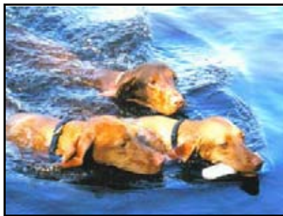
Cooling off at the August fun weekend.